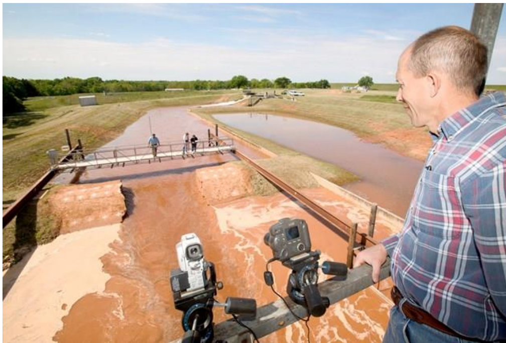
Bird's Eye View of Embankment Breach Research

The impact of this research is expected to lead to improved emergency action plans, flood warning systems, zoning regulations, and prioritization of dams for rehabilitation. The ARS research effort also includes cooperation with the NRCS, the US Army Corps of Engineers, Universities, the international scientific community, and other stakeholders in the evaluation of the software.